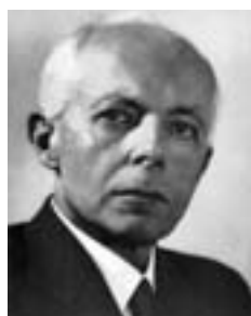
BÉLA BARTÓK Hungarian composer (1885–1945)