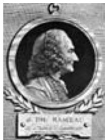
JEAN-PHILIPPE RAMEAU French composer (1683–1764)