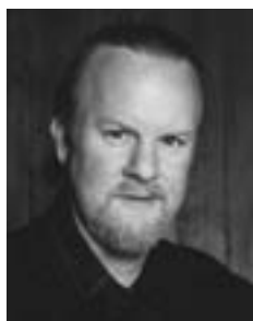
LEE BRACEGIRDLE Australian composer (born 1952)