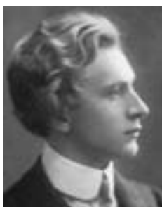
PERCY GRAINGER Australian composer (1882–1961)