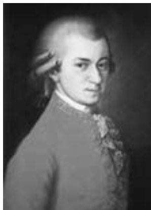
In Vienna Mozart became known as a composer and piano virtuoso (posthumous portrait by Barbara Krafft, 1819)

This is the Sydney Symphony's first performance of the concerto.