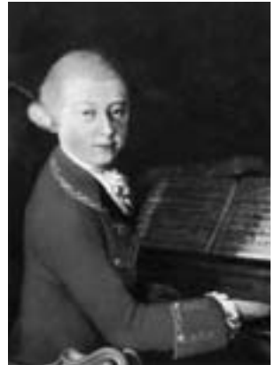
Mozart aged 14

This is the Sydney Symphony’s first performance of the Symphony No.15 in G, K124.