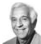
Vladimir Ashkenazy Principal Conductor and Artistic Advisor