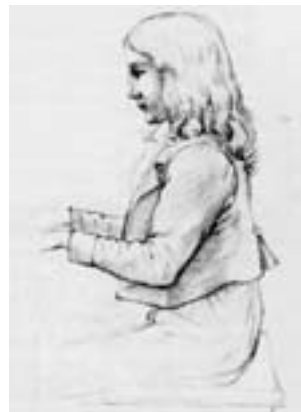
Felix Mendelssohn at the piano, aged 12, a sketch by family friend, later Felix’s brother-in-law, Wilhelm Hensel (1821)

The resourcefulness of Mendelssohn’s handling of instrumental textures marks the whole of the Octet, moving seamlessly between near-orchestral effects and