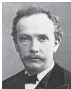
RICHARD STRAUSS German composer (1864–1949)

Listen, too, for the imitative dialogue between horn and piano and the way Bartók dispels – often in humorous ways – textures that threaten to become too intricate. In the second movement the duo arrangement is between piano and timpani, in fact the piano is introduced with a timpani roll. The strings are given an almost completely static pattern of chords. A highlight of the finale is a section of shimmering colour, a moment of calm before the brilliant conclusion.