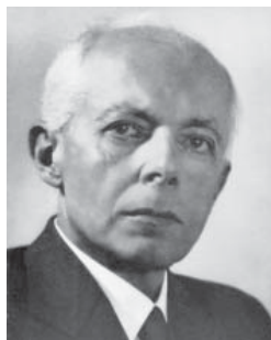
BÉLA BARTÓK Hungarian composer (1881–1945)