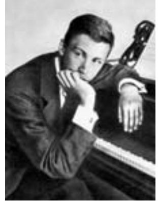
Prokofiev at the piano (1910)