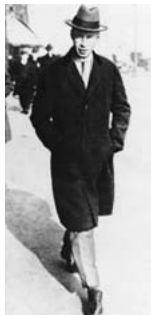
Prokofiev in Chicago