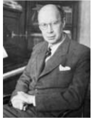
Prokofiev towards the end of his life

The final movement seems most easily identifiable with the audience originally designated for the work, as it noisily bursts forth in a sprightly gallop. A yearning subsidiary theme leads to a playful march, recalling the humour of an earlier youth-oriented work, Peter and the