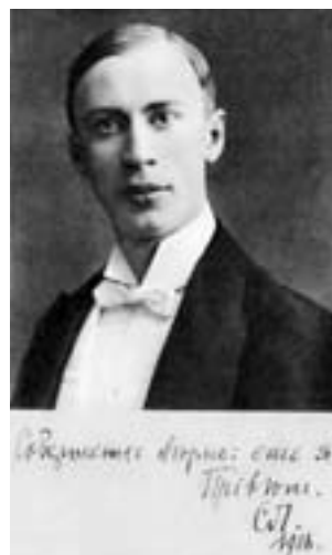
Autographed photograph of Prokofiev in 1916 – "That's right, it's I."

In America, however, Prokofiev had been able to catch the mood and taste of his audience with his comic-fantasy opera The Love for Three Oranges . He'd set out to amuse and the music does just that. After his return to Russia in 1936 Prokofiev experienced mixed success. He was feted for Romeo and Juliet , but his Sixth Symphony was denounced. His Seventh Symphony met with more favour, even though it doesn't quite fit the expected character of a symphony. Its structure is true to form, but the music itself is often yearning and wistful, as if maturity and the trials of life had led its composer to treasure a subtle and poetic style.