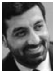
HH SHEIKH AHMED BIN SAEED AL-MAKTOUM CHAIRMAN AND CHIEF EXECUTIVE, EMIRATES AIRLINE AND GROUP

We look forward to creating more memorable experiences together in 2009.