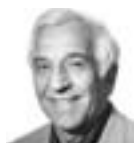
Vladimir Ashkenazy Principal Conductor and Artistic Advisor