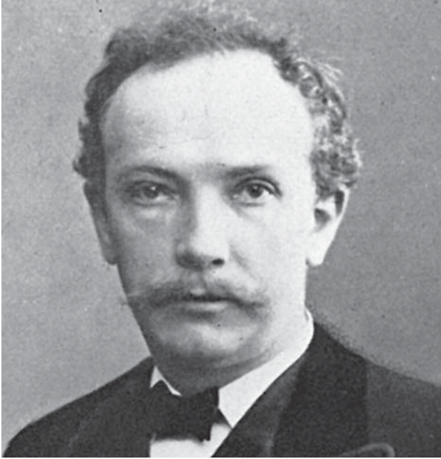
RICHARD STRAUSS German composer (1864–1949)