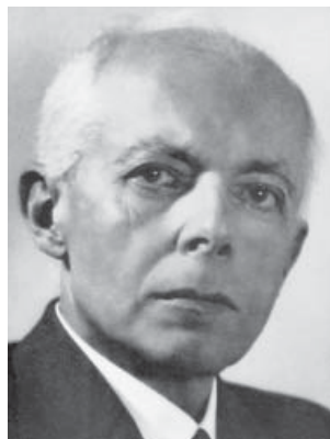
BÉLA BARTÓK Hungarian composer (1881–1945)