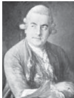
Thomas Gainsborough's portrait of Johann Christian Bach

Apart from this single piece, the London Bach's influence on Mozart helped the younger composer develop, by imitation, a very different style. Absorbing the Italian atmosphere and studying with Sammartini, Christian Bach had blended 'Italian melody and German science' in a style especially marked by balance, smooth transitions, and the 'singing allegro' finding an equivalent