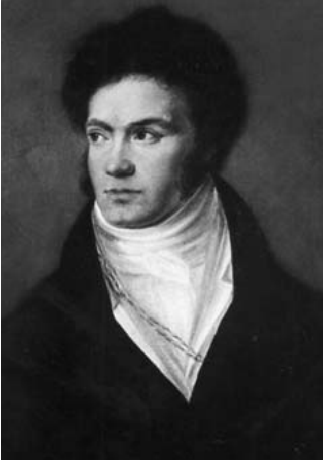
Ludwig van Beethoven, 1806

...Beethoven not only fulfilled but far surpassed their expectations.