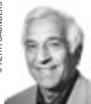
Vladimir Ashkenazy Principal Conductor and Artistic Advisor