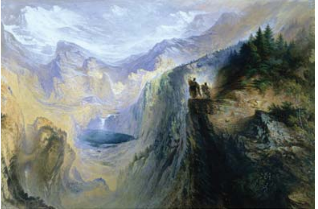
Manfred on the Jungfrau (1837), watercolour by John Martin, inspired by the following lines from Byron's poem, in which Manfred is on the brink of committing suicide by tossing himself from the crag, only to pulled back from the edge by a hunter.

...And you, ye crags upon whose extreme edge I stand, and on the torrent's brink beneath Behold the tall pines dwindled as to shrubs In dizziness of distance, when a leap, A stir, a motion, even a breath, would bring My breast upon its rocky bosom's bed To rest for ever – wherefore do I pause? ...Thou winged and cloud-cleaving minister, Whose happy flight is highest into heaven, Well may'st thou swoop so near me... ...How beautiful is all this visible world! How glorious in its action and itself!