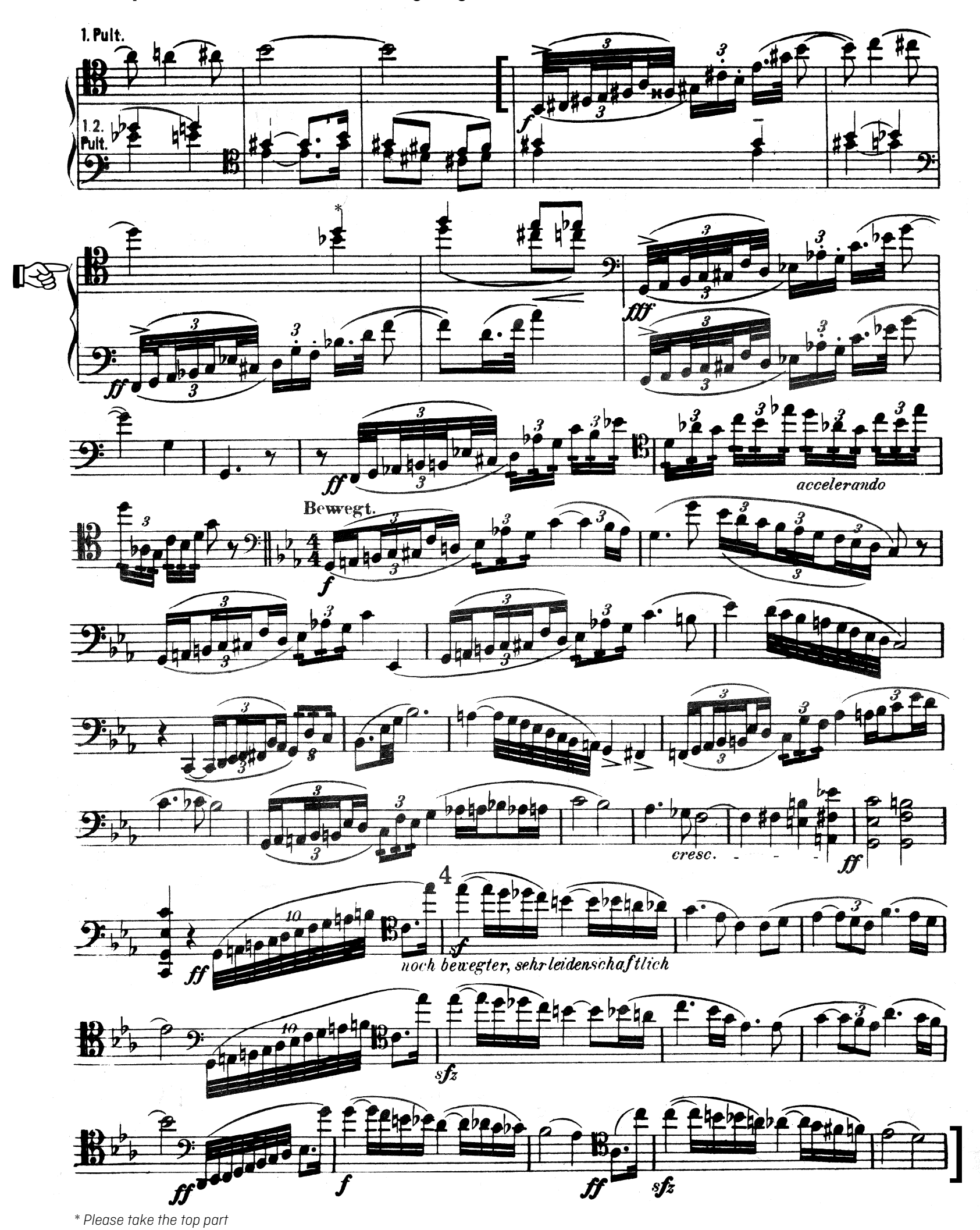
Excerpt 1 Früheres Zeitmass (mässig langsam)