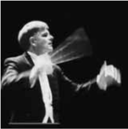
Stuart Challender, SSO Chief Conductor and Artistic Director 1987–1991