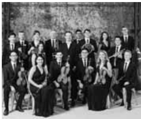
Sydney Symphony Orchestra 2016 Fellows