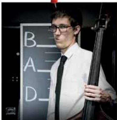
Mr Double Bass – a low type, boring but steady