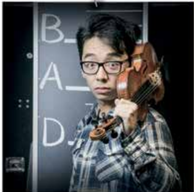
Mr Violin – the trickier part