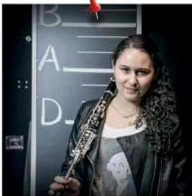
Ms Clarinet – claims she's not sneaky