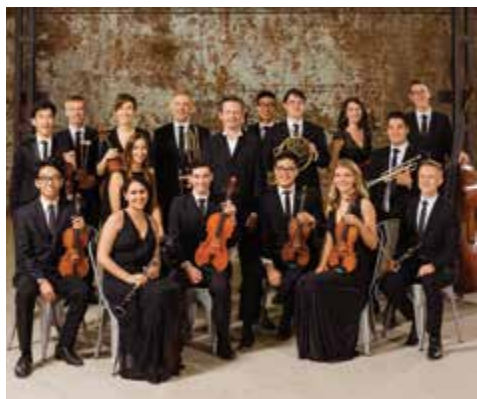
Sydney Symphony Orchestra 2016 Fellows