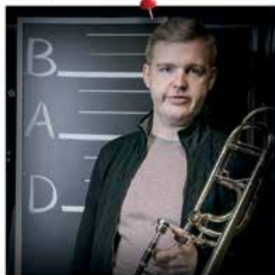
Mr Trombone – sliding out of reach of the law