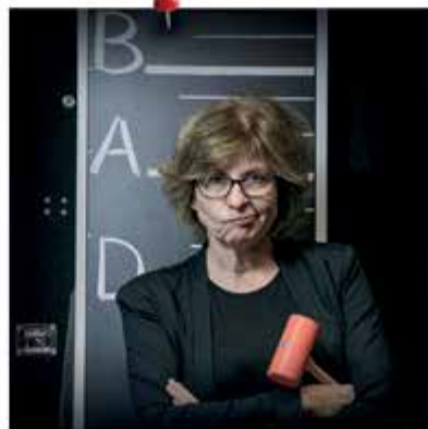
Ms Percussion – always hitting things