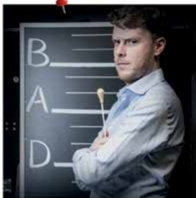
Mr Conductor – plenty of enemies