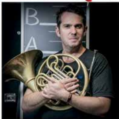
Mr French Horn – did not understand the question