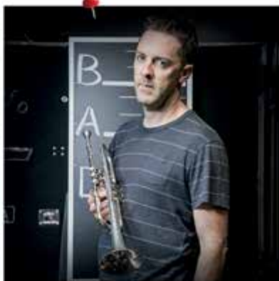
Mr Trumpet – boisterous and utterly brazen