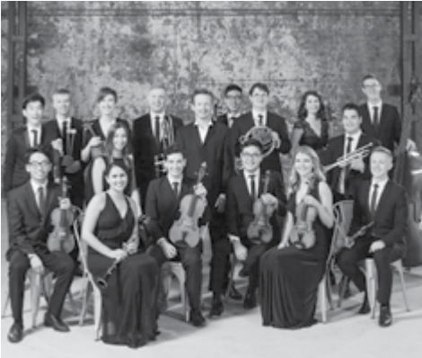
Sydney Symphony Orchestra 2016 Fellows