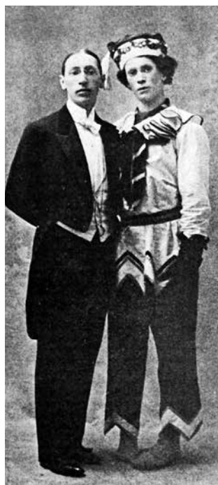
Stravinsky with Vaslav Nijinsky in costume as Petrushka .