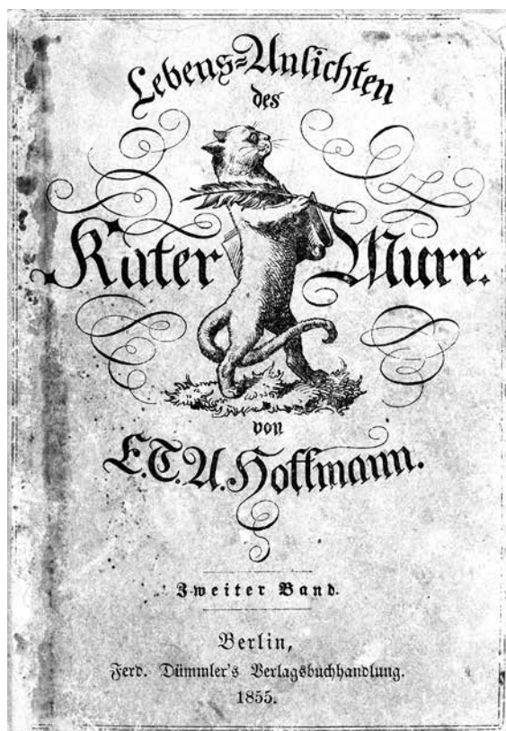
◀ Frontispiece from the 1855 edition of ETA Hoffmann's Kater Murr .

immersion, at this time, in Bach (especially his Well-Tempered Clavier ) is evident in passages of the Kreisleriana such as the dance-like episode in the second piece, the fugato of the seventh, and the rhythmic accentuation of the triplets in the middle section of the first piece making a cantilena stand out. Kreisleriana is a cycle, through thematic connections sensed rather than explicit, and key relationships, alternating pieces in minor keys with related major keys – all the even-numbered pieces are in B flat major.