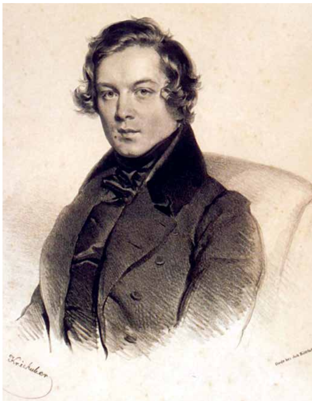
Portrait of Robert Schumann from 1839, the year following Kinderszenen and Kreisleriana (Josef Kriehuber).