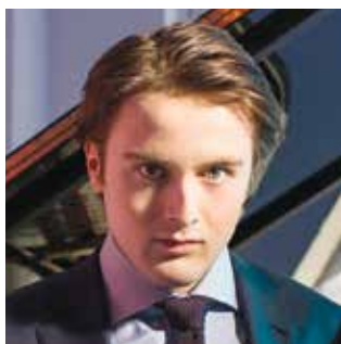
DARIO ACOSTA - DEUTSCHE GRAMMOPHON