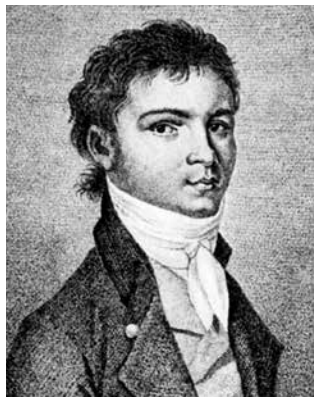
An early portrait of Beethoven from 1800.