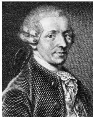
Detail from an engraved portrait of Haydn by Johann Ernst Mansfeld, published in Vienna in 1781.

Haydn was closely involved in the preparation of the sonata for publication, and among the changes he made to the autograph was the addition of detailed instructions for loud and soft playing. Although the set was published as being suitable for harpsichord or the newly popular fortepiano, Haydn is clearly moving towards an overtly pianistic style, while also revealing the influence of the North German clavichord tradition, with its intensity of expression and fondness for capricious gestures. Early in the first movement, for example, Haydn marks