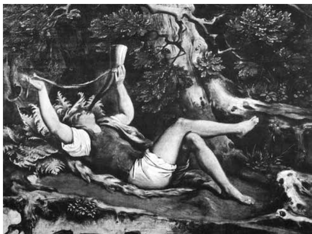
◀ Illustration by Moritz von Schwind for Des Knaben Wunderhorn (c.1850)

The minuet that follows is a musical flower picture, the serenity of which is nudged only by a swift-moving central trio that evokes the spirit of Mendelssohn. The third movement, the scherzo, is more complex, even enigmatic, as the twittering of the forest animals is interrupted by a distant solo on the post-horn. In Western Europe, for generations before Mahler's time, post-horns were used by postilions and guards on mail coaches to announce arrival and departure. Mahler's use of it here is open to many interpretations; the one that seems most plausible sees it as the first 'human' moment in the work, the expression of the tender ecstasy of human feeling on being at one with the world of nature. It is also wonderfully evocative of the heat and haze of high summer, so it is apt that Pan makes an unexpected re-appearance in the movement's final moments.