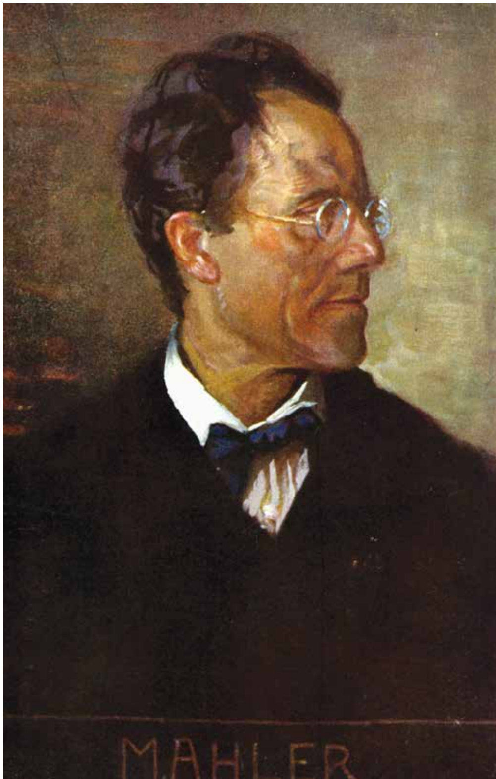
Anonymous oil portrait of Mahler made a few years after the completion of the Third Symphony