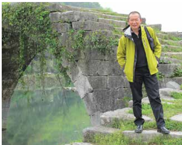
Photos and documents from Tan Dun's research into Nu Shu culture