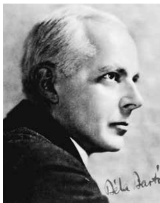
Béla Bartók, 1922

Bartók considered The Miraculous Mandarin one of his finest scores. Though it still operates within the confines of tonal music,