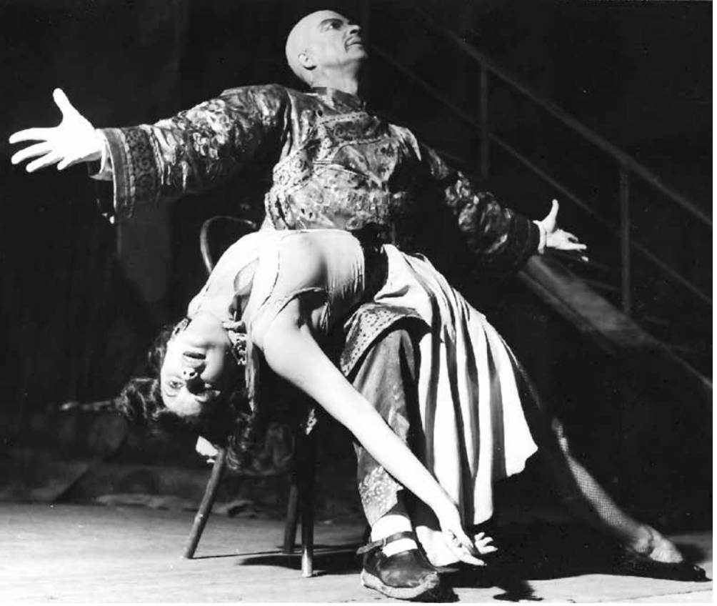
The Girl and the Mandarin – from the 1956 Hungarian State Opera production

harmonic variety is gained from the equal use of all 12 tones. 'We have at our disposal a previously undreamed of wealth of transitory nuances,' Bartók wrote in Melos in 1920, not long after drafting the work, and listing harmonic combinations that could express blankness, daintiness, even forcefulness.