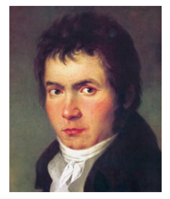
Ludwig van Beethoven

In the first quartet, composed in the middle of 1806, the cello strides in quietly but confidently with the first theme. All the ideas are broadly developed, and strong chordal passages suggest a big space to be filled. 'Scherzando' means joking, and some early listeners thought Beethoven was pulling their leg at the beginning of the second movement, where the cello drums on just one note. Beethoven was being light-hearted here, very inventively so. His slow movement is deeply moving, broad and sad, rising to accents of lamentation and pain. The 'Russian theme' dominates the last movement – like a folk dance, but not simple-minded – as Beethoven puts it through all its paces.