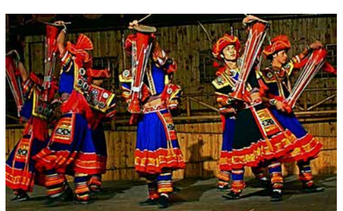
The Yao People's Long Drum Dance