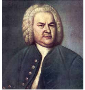
Bach by Elias Gottlob Haussmann, 1746

In his compendious The Art of Fugue , Bach famously used the letters of his name (which in English correspond to the notes B flat-A-C-B natural) to create a musical motif. Numerous composers, such as Schumann, Liszt and Brahms, used the motif in homage, but its tightly wound semitone-tone-semitone shape made an especially perfect fit for composers of atonal and serial music in the 20th century.