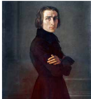
Liszt by Henri Lehmann ca 1839