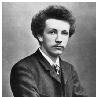
Richard Strauss, 1888