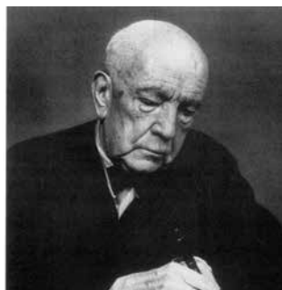
Richard Strauss, 1949