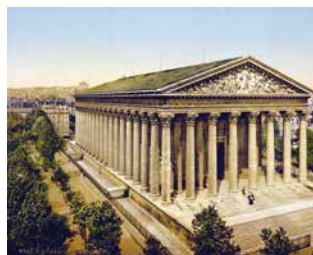
The Church of the Madeleine, Paris, ca 1890-1900