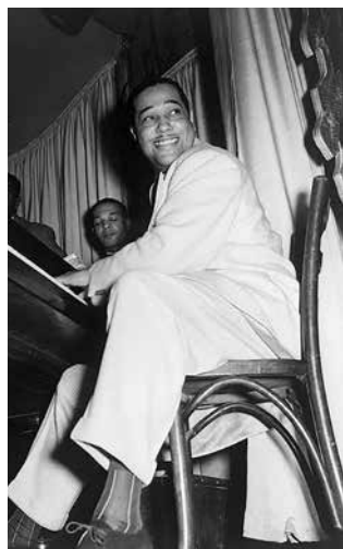
Duke Ellington at the Hurricane Club, 1943

In contrast to the increasingly sophisticated direction taken by some of the emerging big bands elsewhere, the style in Kansas City was a simpler, riff-based approach deeply rooted in the blues. Basie immersed himself in this and forged a style that is still acknowledged as the epitome of swing. Crucial to this was the band's rhythm section, consisting of Basie himself, Page, Jones and guitarist Freddie Green. The key was the section's lightness of touch: Basie changed his pianistic style from the busy stride technique he had learned in Harlem, adopting instead a very sparse style of playing consisting of