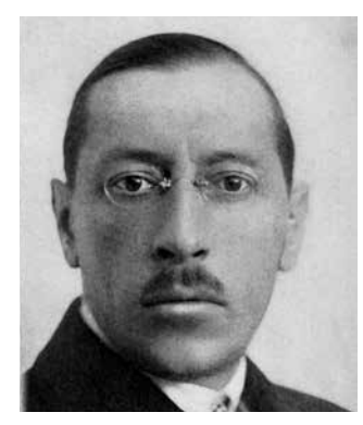
Igor Stravinsky IGOR STRAVINSKY (1882–1971) Ragtime for eleven instruments