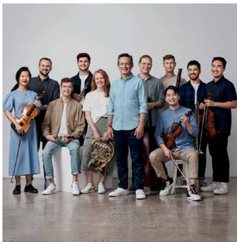
Sydney Symphony Orchestra 2020 Fellows