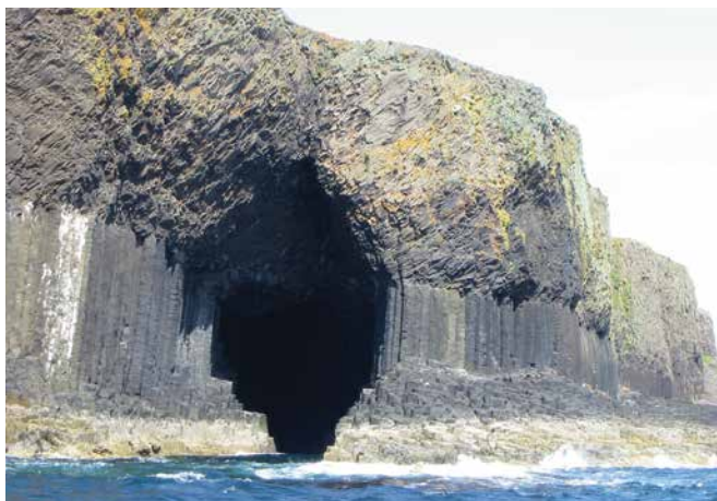
Fingal's cave with its distinctive basalt columns.

The lilting theme, with hints of distantly breaking waves in the timpani, gives way to a song-like tune in the cellos before the music passes into a mood of Beethovenian striving and, after a brief respite, a chirpy woodwind motif. Mendelssohn's development of his material is often abrupt and changeable, much like the Atlantic seascape that inspired the music.