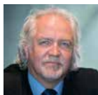
Donald Runnicles PRINCIPAL GUEST CONDUCTOR