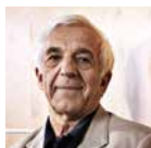
Vladimir Ashkenazy CONDUCTOR LAUREATE