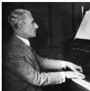
Ravel at the piano

Ravel once said that a concerto 'should be light-hearted and brilliant, and not aim at profundity or dramatic effects'. In the first movement, with its whip-cracking opening, there is some hint of