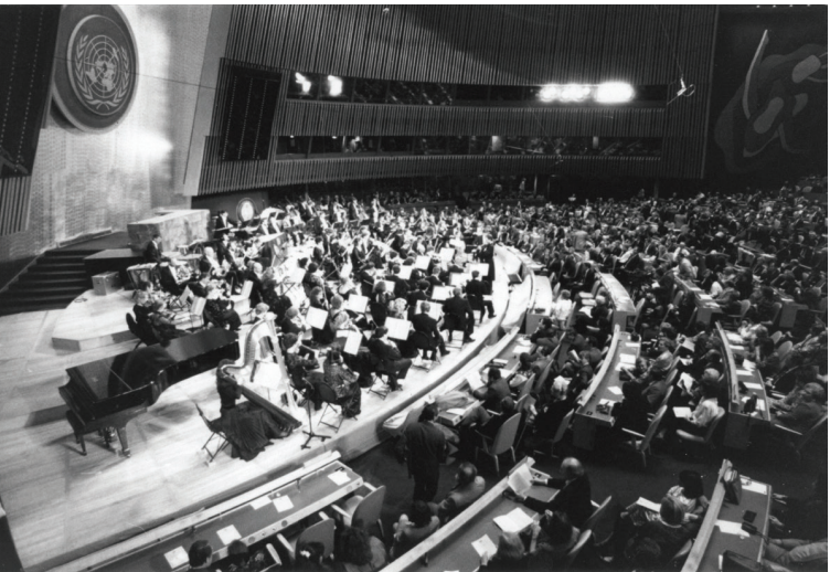
The Orchestra performing at the United Nations General Assembly under Chief Conductor Stuart Challender, 1988.