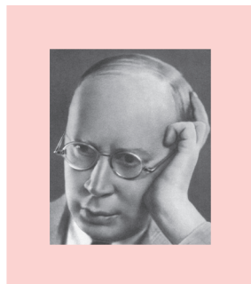
Prokofiev in the 1930s