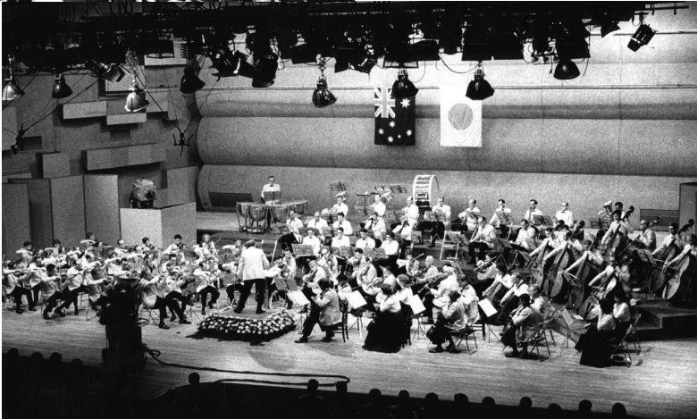
A performance during the Orchestra's first overseas tour to Manila, Tokyo and Hong Kong in 1965.