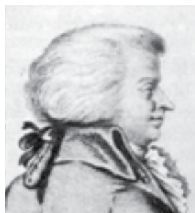
Mozart in 1785, by Johann Blasio