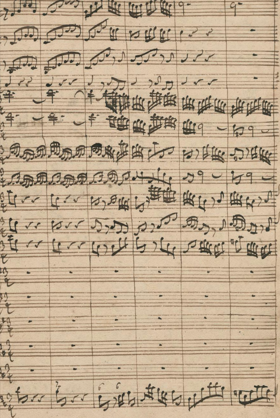
The first page of Bach's Magnificat BWV 243, in his own handwriting.