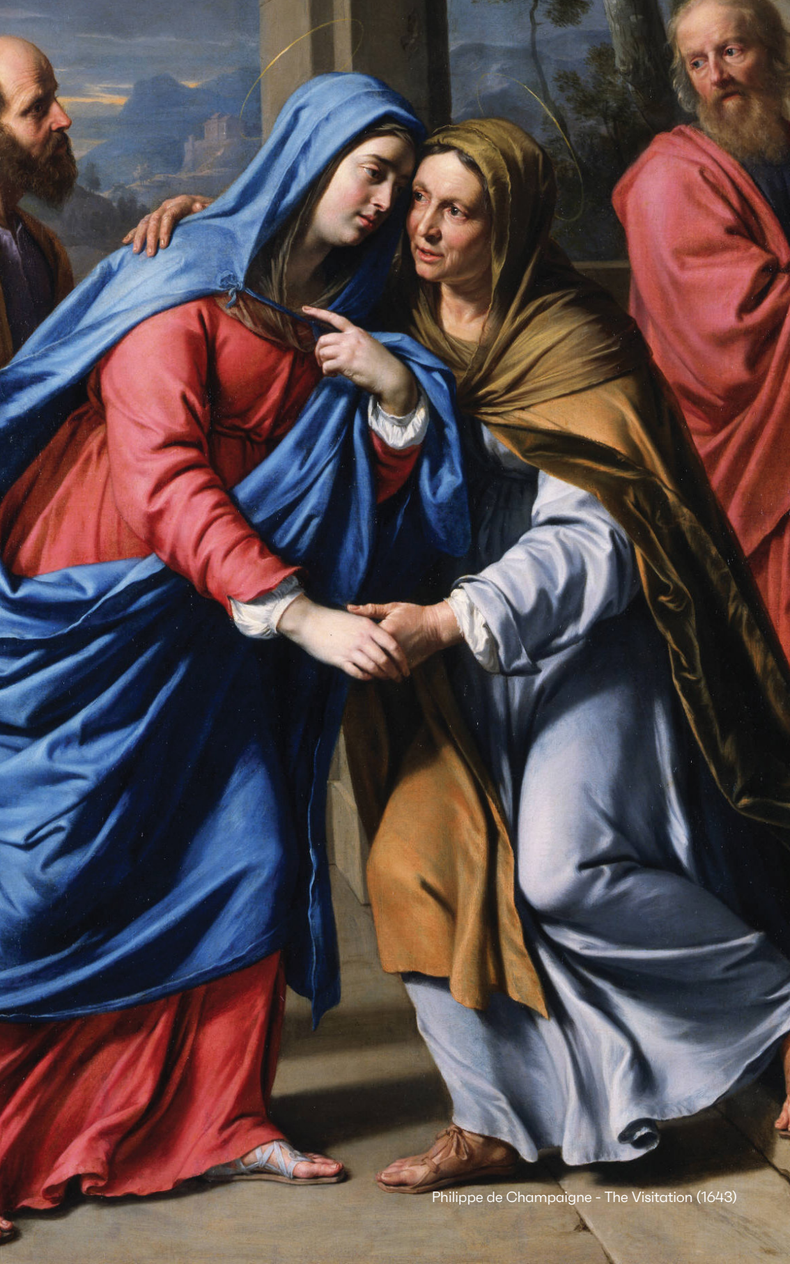
Philippe de Champaigne - The Visitation (1643)