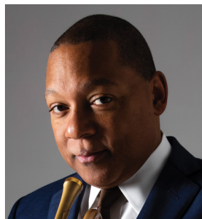
Wynton Marsalis

In 2001, Marsalis was appointed Messenger of Peace by Kofi Annan, former Secretary-General of the United Nations; he has also been designated cultural ambassador to the United States of America by the U.S. State Department through their CultureConnect program. In 2009 he was awarded France's Legion of Honor, the highest honor bestowed by the French government.