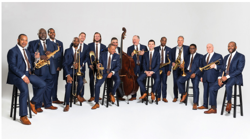
Jazz at Lincoln Center Orchestra.

For more information on Jazz at Lincoln Center, please visit www.jazz.org