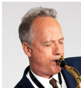
Ted Nash