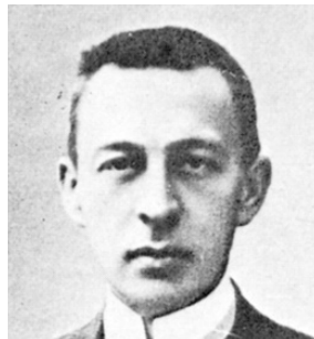
Sergei Rachmaninov in 1900

Whether due to the course in hypnotherapy — after all, it was some months before he began to write again — or simply the passage of time, there is no doubting the sense that something was unleashed within the composer in the works that followed. In the concerto and other compositions of the period (the second Two-Piano Suite and the Sonata for