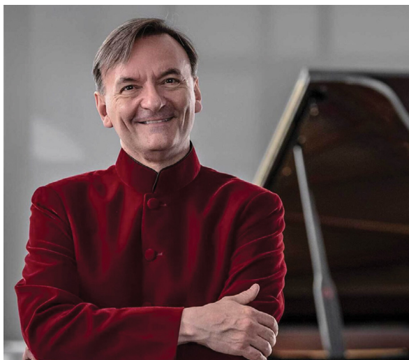
Sir Stephen Hough.

"And when the theme comes in for the first time, all the harmonies are so clearly 40 years later — they couldn't have been written at the time of the original version. So that's what makes this really fascinating. It's the Second that's the less mature piece and the First that's the absolutely mature piece. And that's something to bear in mind for the audience: don't think you're hearing No.1, Op.1 — you're hearing Op.34 or something like that, if we went in the real chronology of Rachmaninov's works."