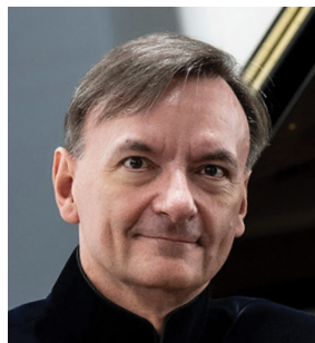
Stephen Hough