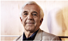
Vladimir Ashkenazy Conductor Laureate