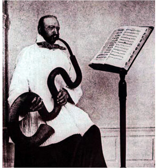
A man playing the serpent, one of the more unusual instruments of the Baroque orchestra

descendant, the waltz; the bourrée, in quick duple time with an upbeat, and its close relative the rigaudon – which we have met in Pisendel's piece; the triple-time hornpipe; and the third- and second-last movements here, which are sometimes referred to as country dances but are really jigs.