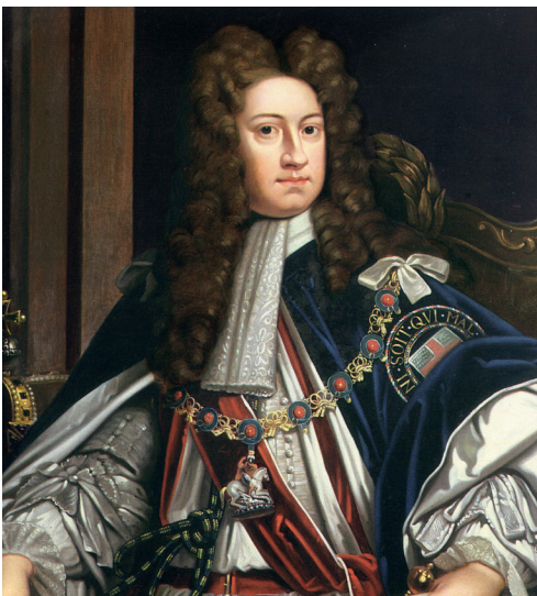
Philippe Mercier's portrait of Handel