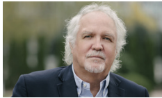
Donald Runnicles Principal Guest Conductor