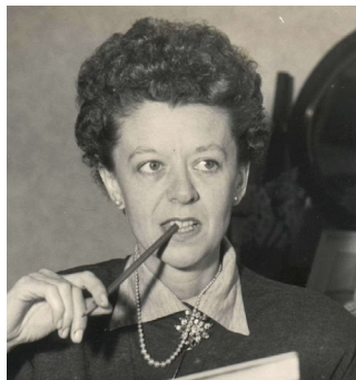
Peggy Glanville-Hicks in New York

Throughout her life she was fascinated by ancient Greece, and these three dances evoke the hard-won grace and poise that was believed to complement the training of warriors in ancient Sparta.