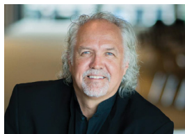
Donald Runnicles Principal Guest Conductor