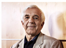
Vladimir Ashkenazy Conductor Laureate