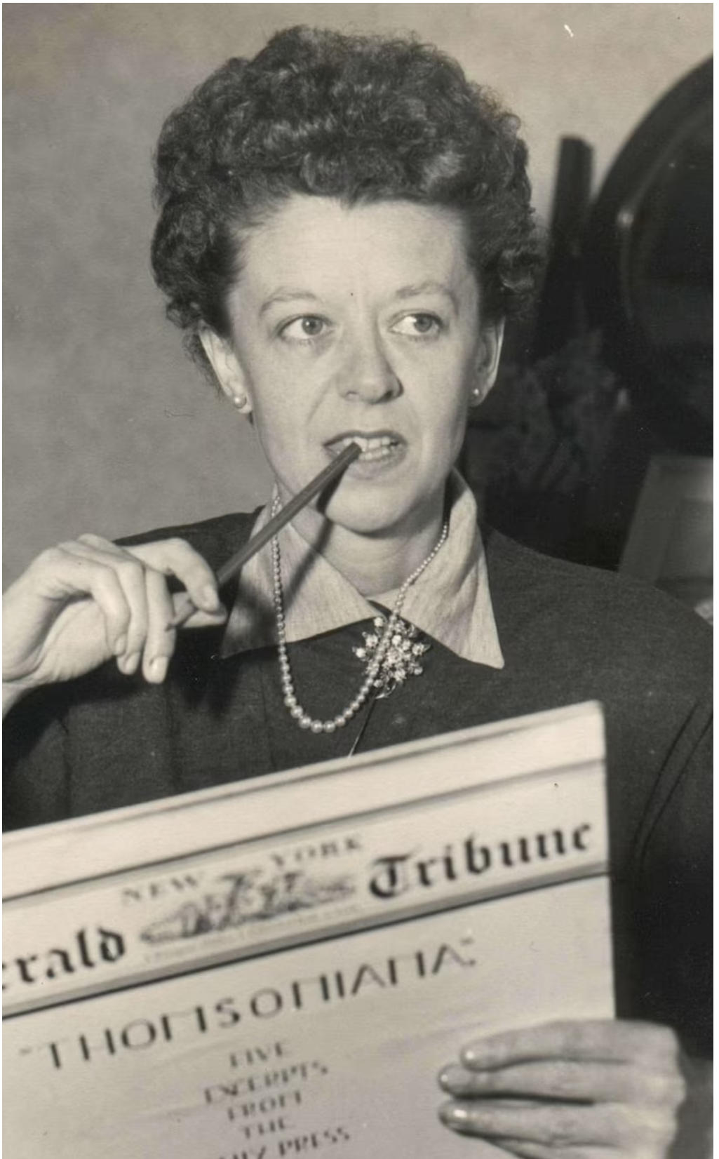
Peggy Glanville-Hicks in New York