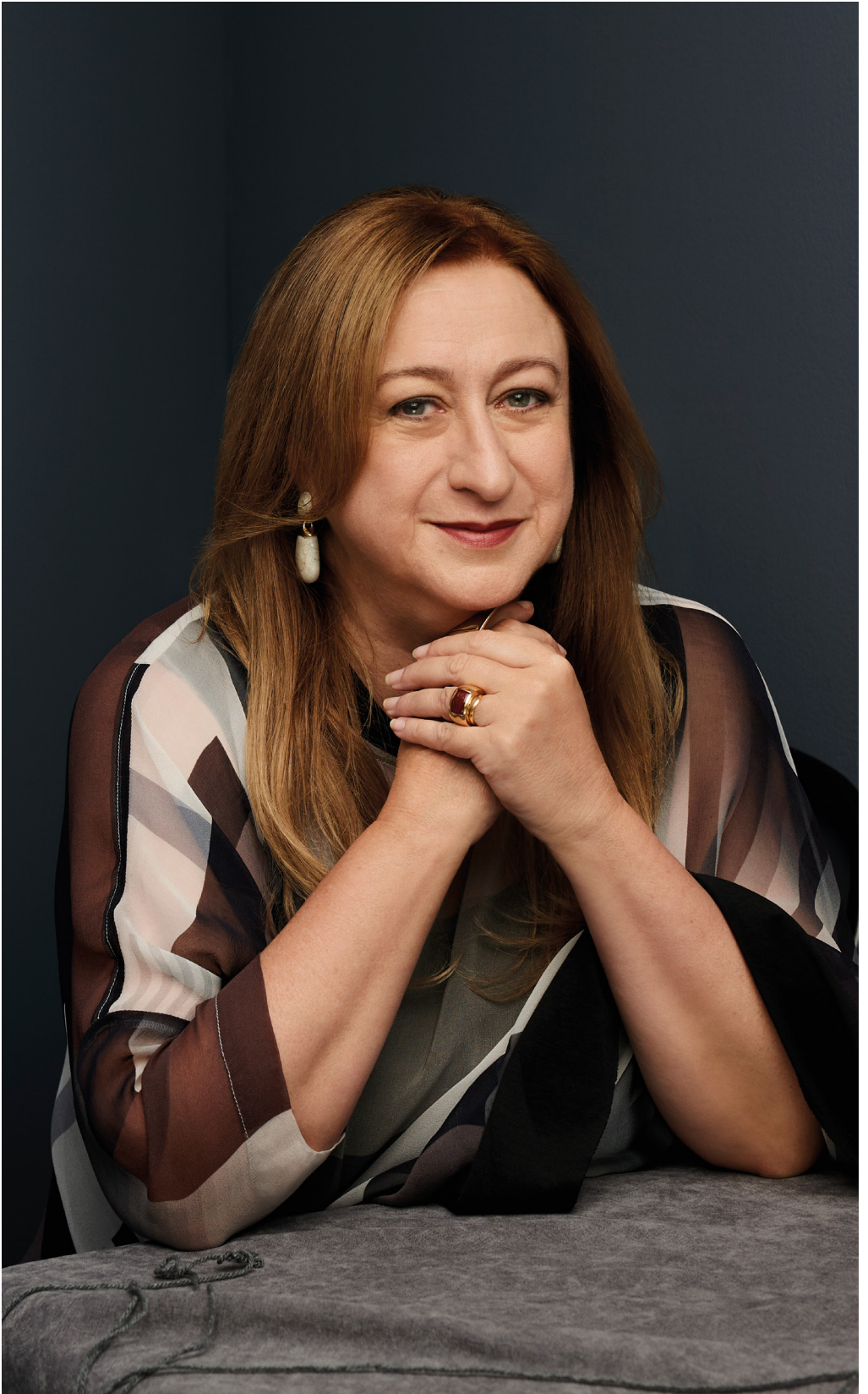
Simone Young.