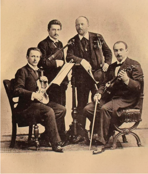
Bohemian Quartet – Karel Hoffmann (1st violin), Josef Suk (2nd violin), Hanuš Wihan (cello), Oskar Nedbal (viola).

The chorale had long been a popular prayer of intercession to the patron saint of Bohemia, the 10th-century Duke Václav (or Wenceslas), martyred by fratricide while still in his 20s, who was himself the grandson of a martyred Christian saint, Duchess Ludmila. To the citizens of Prague he remains the saint whose equestrian statue dominates the city's central Wenceslas Square, while English-speakers venerate him as the 'good king' of the Christmas carol. Since the 12th century, the hymn to St Wenceslas has encouraged a sense of patriotic identity among the Czech people, both in its original plea to 'have mercy upon us, comfort the sad, and ward off evil' and in further stanzas added over the centuries as the original, severely simple melody was itself extended and elaborated.