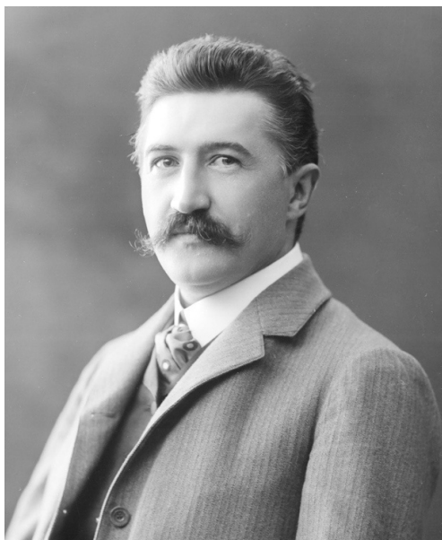
Josef Suk in 1906