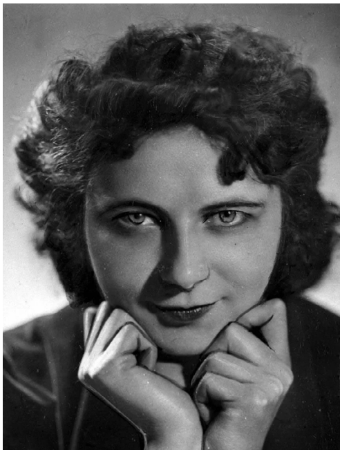
Grażyna Bacewicz.

The War and the descent of the Iron Curtain didn't completely isolate Bacewicz from western European music – especially after the death of Stalin and the thaw which allowed the first Warsaw Autumn Festival to go ahead in 1956 – but circumstances and temperament meant that her music tended more to explore the possibilities of diatonic, neoclassical musical language than, say, serialism.