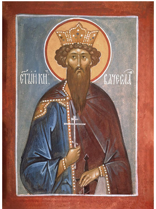
A medieval icon of St Wenceslas

After the war, in 1920, Suk composed two further works which, though independent in themselves, were linked with the St Wenceslas Meditation under the same opus number as his 'War Triptych' and dedicated to the young Czechoslovak Republic. The Legend of the Dead Victors , Op 35b, commemorates the sacrifice of all who suffered to secure the future, and the march Towards a New Life , Op 35c, subsequently dubbed the Ceremonial Sokol March as winner of a competition for the physical training units of the Sokol organisation, won the highest musical award (albeit designated second prize) at the 1932 Los Angeles Olympics.