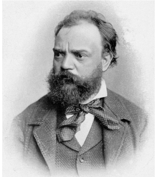
Dvořák in 1882

Simrock was duly impressed with the young composer's work and commissioned a set of Slavonic Dances for piano duo. These, as Simrock had expected, were an instant hit, and again in their orchestral version. Simrock made a huge profit, and Dvořák's reputation spread rapidly in Europe, such that by 1879 his 'Slavonic' String Quartet had been premiered by the ensemble led by the great Joseph Joachim, and Hans Richter had commissioned the work we now know as his Sixth Symphony for Berlin.