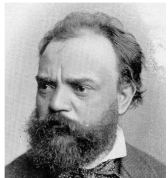
Dvořák in 1889

Contemporary music included Tchaikovsky's Piano Concerto No.1 , Grieg's incidental music to Peer Gynt , and Bizet's Carmen .