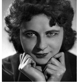
Grażyna Bacewicz.

Contemporary music included Stravinsky's Mass , Samuel Barber's Knoxville: Summer of 1915 , and Schoenberg's A Survivor from Warsaw .