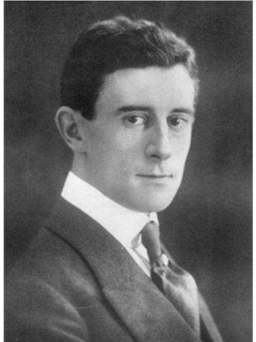
Ravel in 1913

Ravel was born in south-western France to a Basque mother and Swiss father but spent his entire life in Paris. Like Tchaikovsky, he saw a strong connection between childhood and enchantment. In his opera L’enfant et les sortilèges a destructive child learns the value of compassion when furniture, trees and animals in the garden all come magically to life. The evocation of ‘the poetry of childhood’ in the original piano duo version of Mother Goose led Ravel to ‘simplify my style and refine my means of expression’.