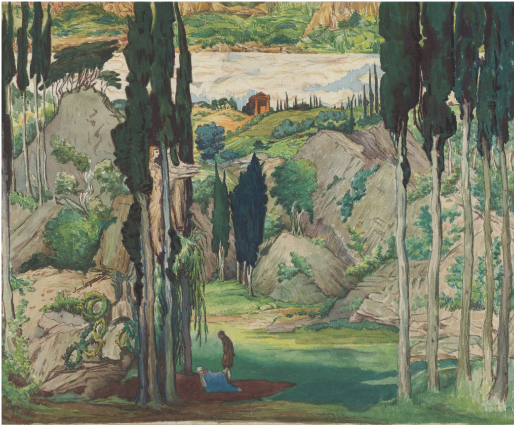
Léon Bakst's drawing of the set design for the world premiere of Daphnis and Chloé, which took place at the Théâtre du Châtelet in Paris on 8 June 1912.

As the first scenario develops, antagonists such as Dorcon (Daphnis' rival) and the pirates (Chloé's abductors) are introduced, with changes in character marked by the addition of percussion and a sense of rhythmic impulse that drives the tension and action. Conversely, in moments of heightened mystery or eroticism - likewhen Daphnis meets his seductive admirer Lyceion, or Chloé is forced to dance for her freedom - Ravel experiments with melodies that meander and swell, and with harmonies that feel unsettled, landing somewhere between beautiful and uncomfortable. Ever the orchestrator, he luxuriates in the interesting timbre created by two of the same instrument playing melodies in unison, one higher and one lower, so that the sound becomes richer.