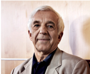
Vladimir Ashkenazy Conductor Laureate