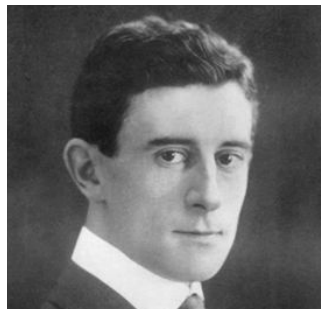
A photograph of Maurice Ravel, published in The Musical Times in 1913.

Contemporary music included Schoenberg's Pierrot lunaire , Richard Strauss' Ariadne auf Naxos and 'Aus tiefer Not' by Arnold Mendelssohn.