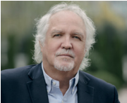
Donald Runnicles Principal Guest Conductor