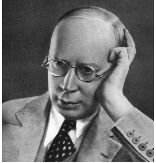
Sergei Prokofiev in the late 1930s

Prokofiev's easiest time with the regime came in the early 1940s, but by 1948 he was publicly denounced, and in poor health. His foreign first wife, from whom he was separated, was sent to a labour camp; he told his second that his 'soul hurt'. In 1953, he died – an hour before Stalin, whose funeral orgy meant that Prokofiev's few mourners couldn't even buy flowers for his coffin.