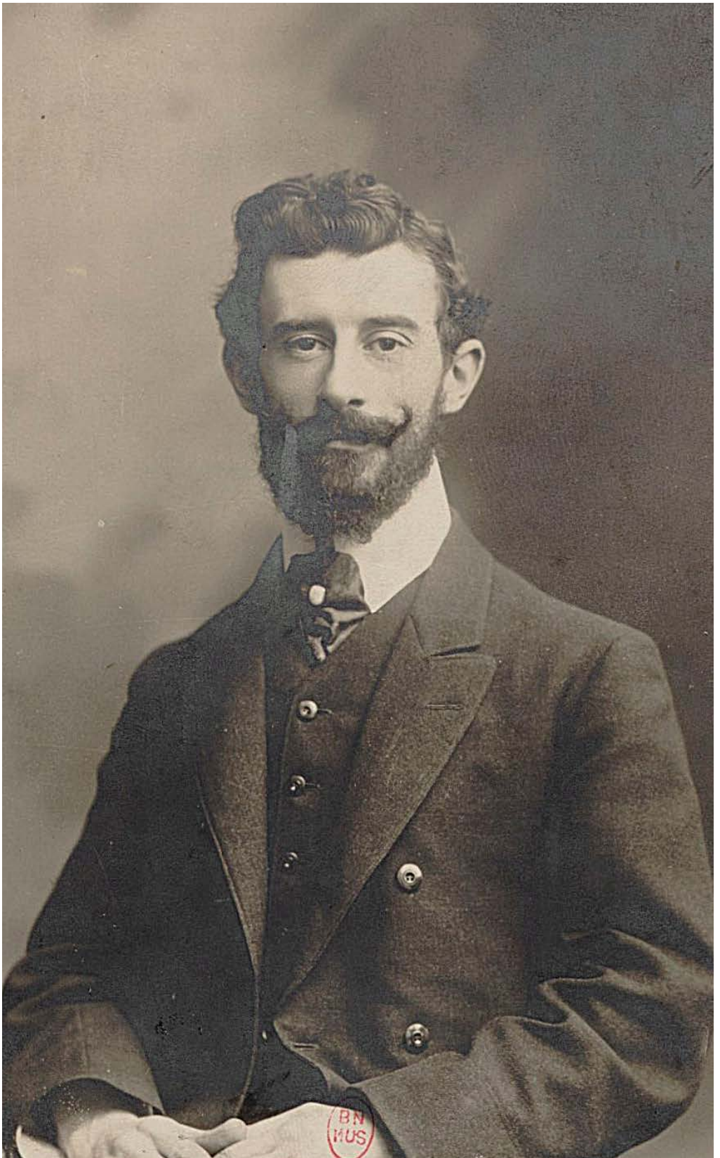
1907 photograph of Maurice Ravel.