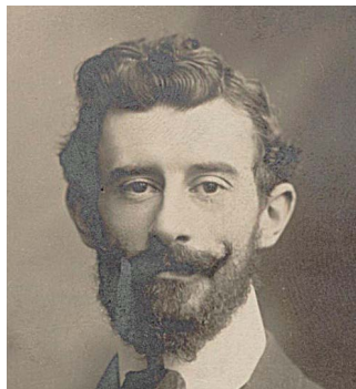
1907 photograph of Maurice Ravel.

Contemporary music included Schoenberg's Pierrot lunaire , Richard Strauss' Ariadne auf Naxos and Alban Berg's 'Altenberg' Lieder.