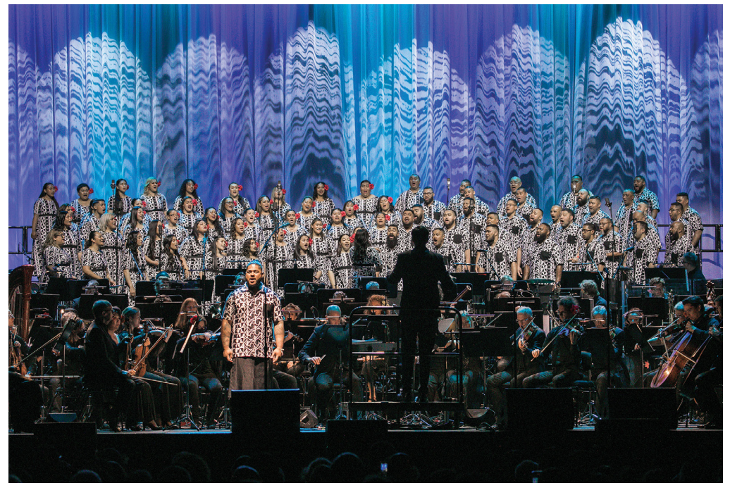
Signature Choir performing with the New Zealand Symphony Orchestra, November 2023.

Now making their Australian debut on one of the world's most iconic stages, Signature Choir joins forces with the Sydney Symphony Orchestra to deliver an experience that's unapologetically Pasifika — bold, rooted in faith, and woven with the stories, struggles, and strength of their Pasifika people. Every note is a testament to who they are, where they come from, and the future they're building — one rooted in pride, purpose, and possibility.