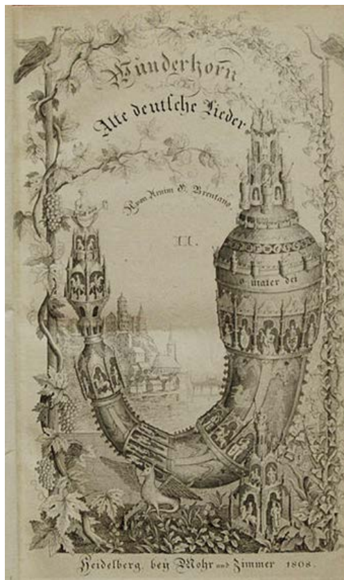
Illustration from the first edition of the collection, Des Knaben Wunderhorn