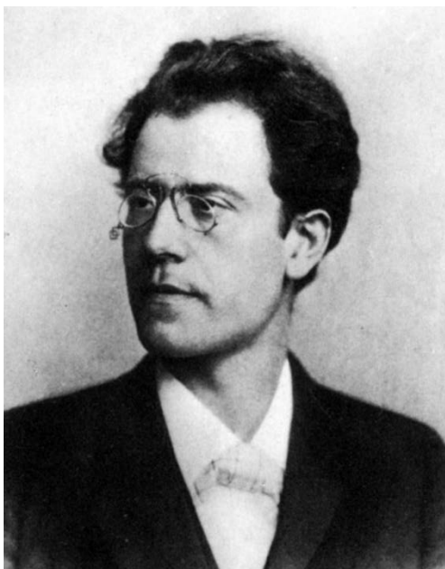
Mahler in 1896