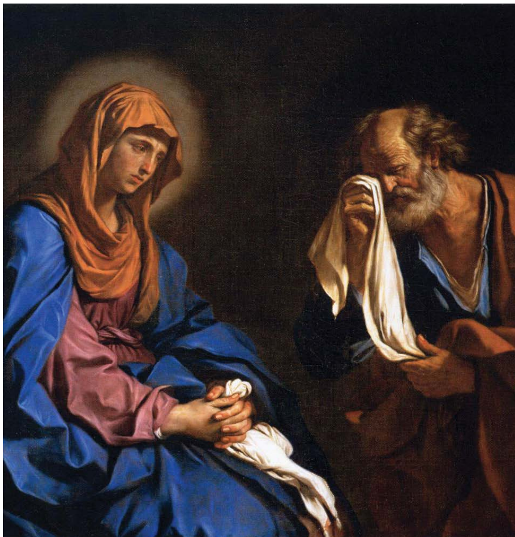
St Peter Weeping before the virgin (1647) by Guercino (Giovanni Francesco Barbieri) (1591–1666).

Deep is its grief! Longing, deeper still than heartache! Grief says: Go hence! But all longing craves eternity, Craves deep, deep eternity.