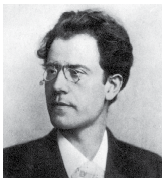
Gustav Mahler in 1896

Contemporary music included the premieres of Puccini's La bohème , Richard Strauss' Also sprach Zarathustra and Sibelius' Lemminkäinen Suite.