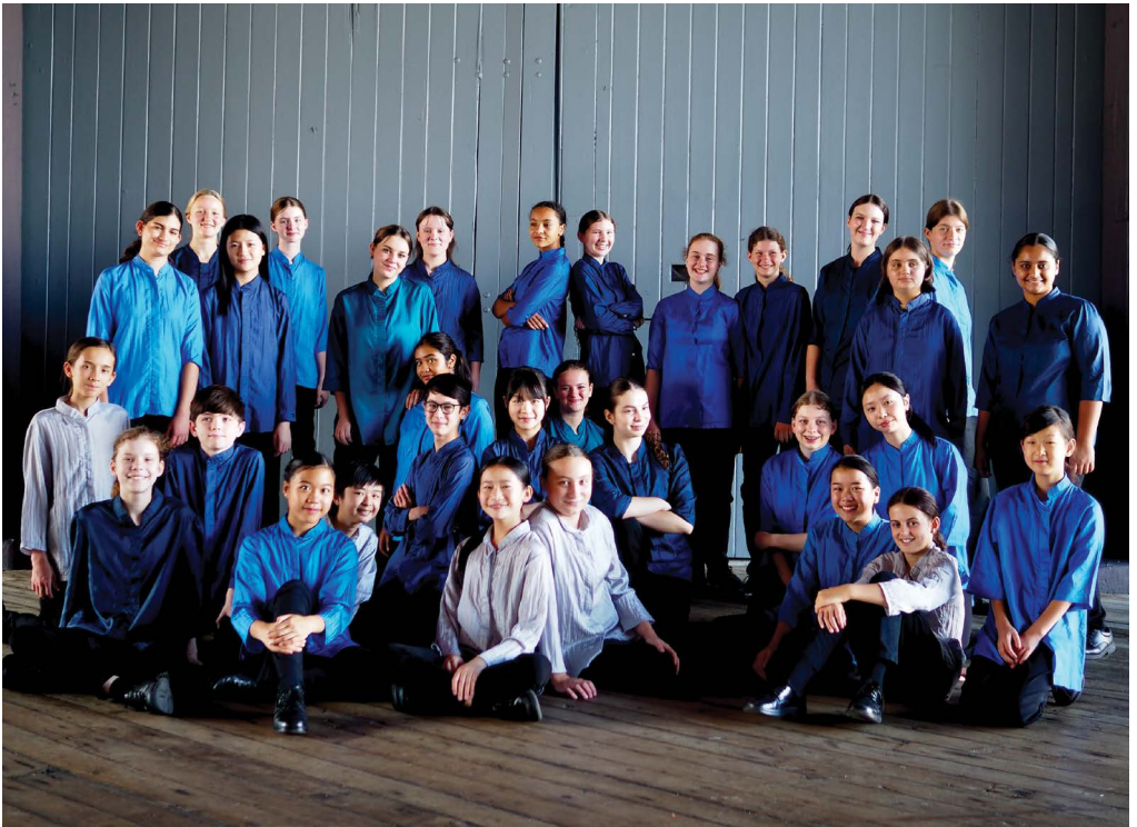
Sydney Children's Choir.